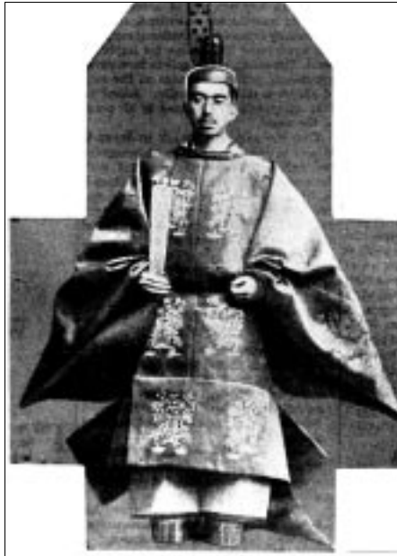
Hirohito in Imperial robes.