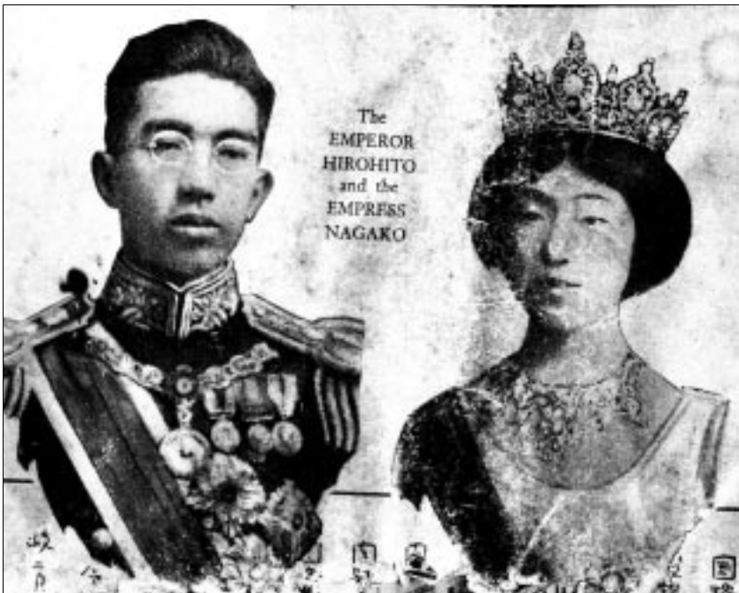
Emperor Hirohito and Empress Nagako.

of favour. The Strike-North faction favoured expansion into Communist Russia rather than southwards into China and other Asiatic countries where there were raw materials in which Japan was lacking. He believed there would be war with Russia by 1936. Araki put short-term military preparations in hand. He was the most powerful man in the cabinet. He and his friend, General Mazaki, were regarded as leaders of the Kodo-ha or the 'Imperial Way School' (Strike-North Faction). The Kodo-ha began to lose ground in 1934 and General Araki resigned, supposedly from ill health. In January 1934 he accepted elevation to the ranks of the Supreme War Councillors.